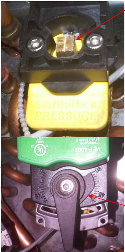
Valve Stem Marking