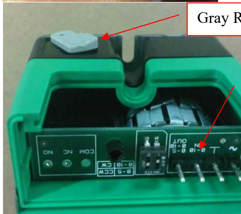
Gray Release Lever