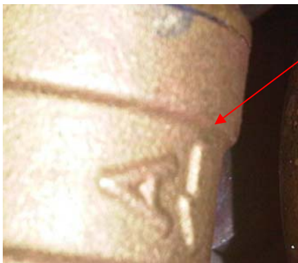
Water Direction Arrow

If for any reason you need to remove these actuators, follow these steps outlined here in making sure you have the valve actuator placed in the correct position.