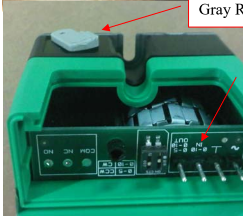
Gray Release Lever