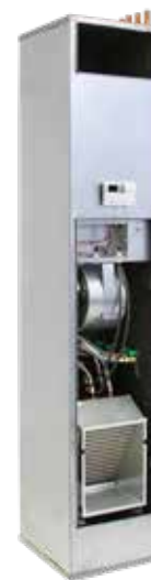
Coil Pack shown fully inside the Whalen cabinet.