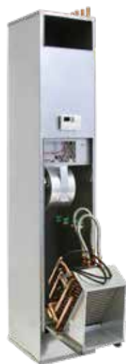
Coil Pack shown almost fully out of the cabinet. The flex hoses and easy access to the valve package components make equipment maintenance a snap – even if you have large hands!