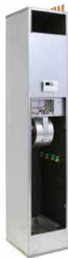
Whalen cabinet shown before the coil pack is slid in.