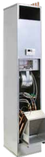
Coil Pack shown halfway in/out of cabinet. The flex hoses facilitate easy slide in/slide-out functionality.