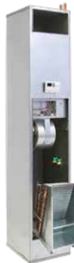
Coil Pack shown halfway in/out of cabinet.