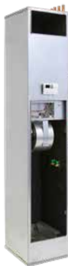
Whalen cabinet shown before the coil pack is slid in.