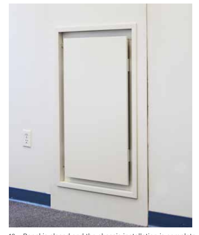
16. Panel is closed and the chassis installation is complete.