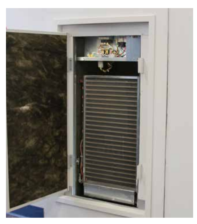
13. The chassis is installed and the water and electrical connections are made.