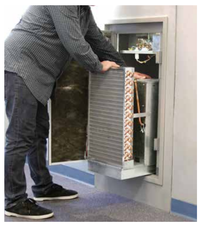
10. Before sliding the chassis completely into the unit, connect the water hoses.