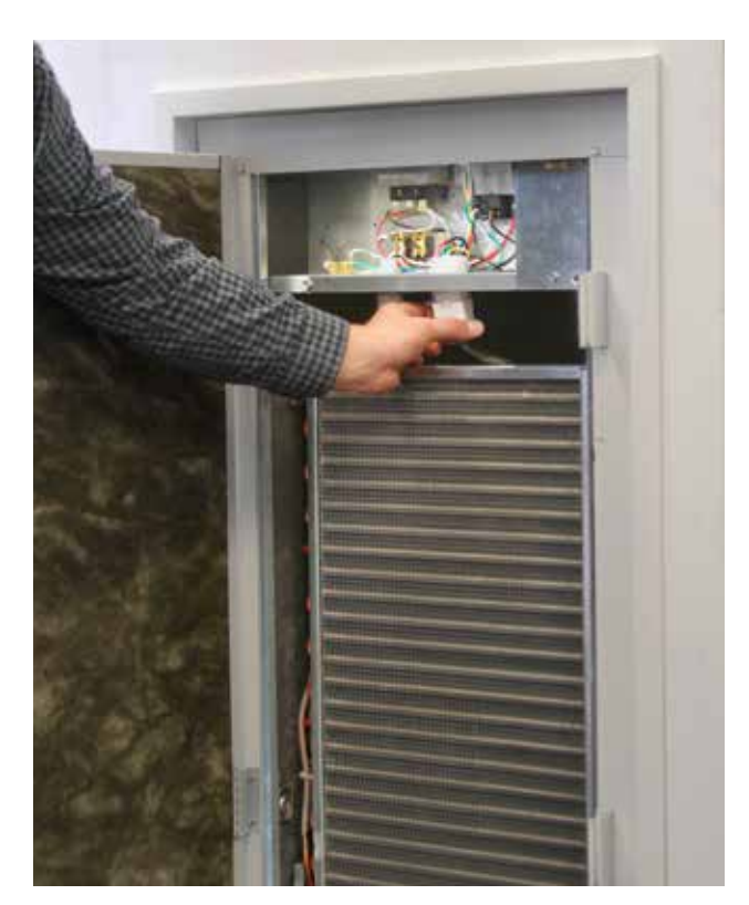
12. Connect the chassis wiring to the bottom of the electrical panel.