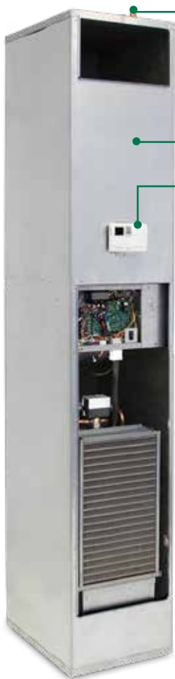
Whisperline® Water Source Heat Pump

As an example of Whalen product flexibility, the options for the Whisperline® Water Source Heat Pump include (but are not limited to):